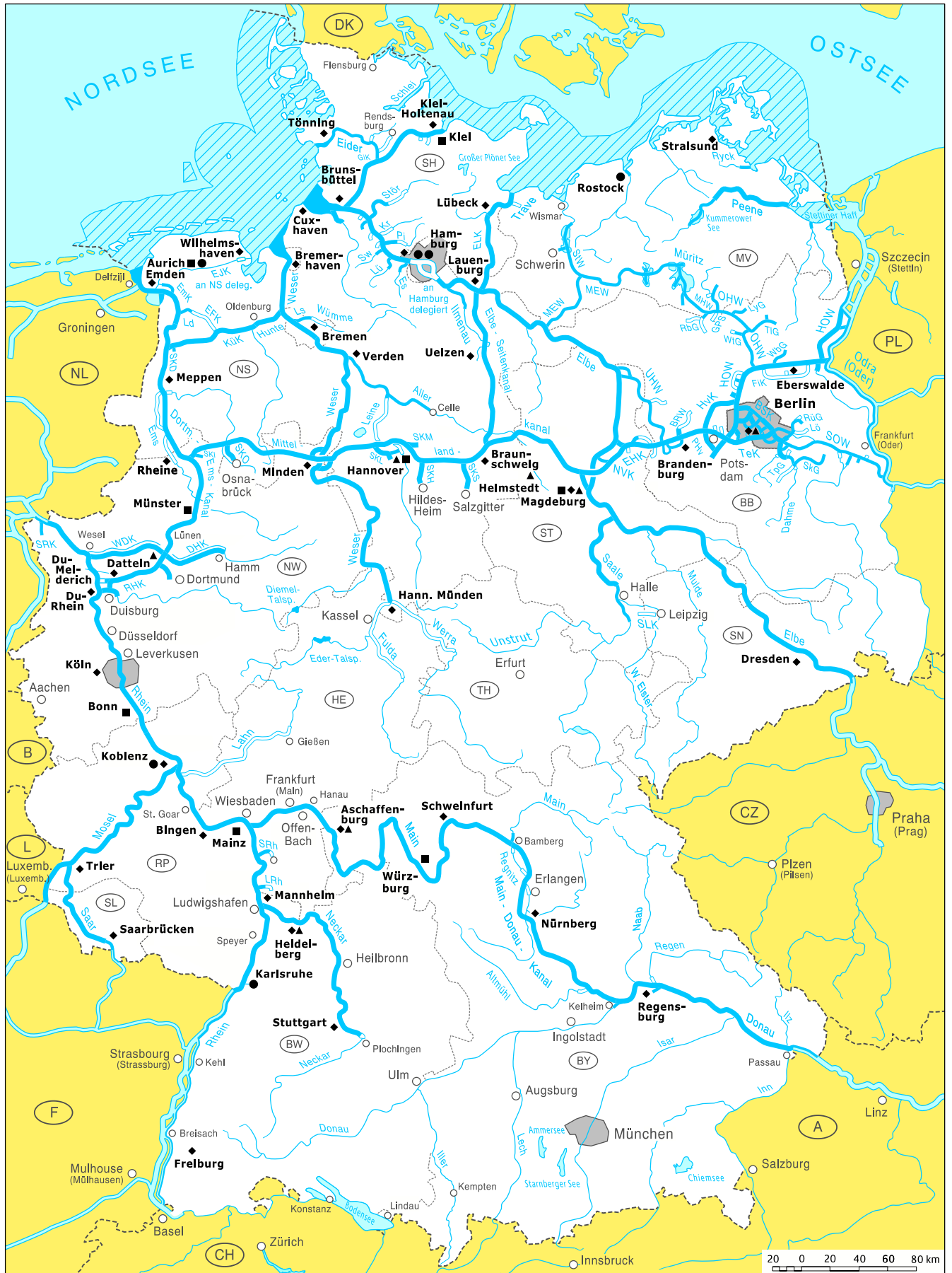
Some German Waterways with a length below 5 km are not depicted due to the map scale.